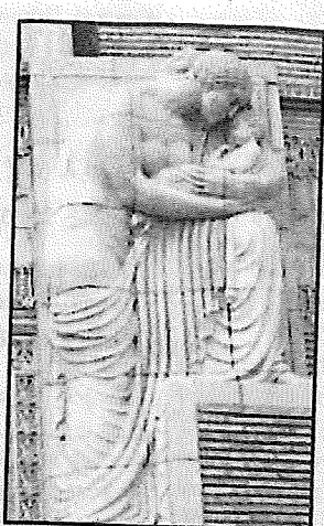
Alphonso Iannelli sculpted figures constructed around themes of justice, agrarian life, and the sacrifices of World War I.