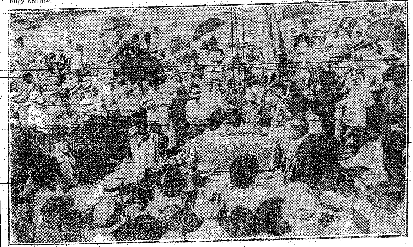
CROWD WITNESSES CEREMONIES.